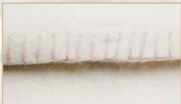
Natural stitch (standard)