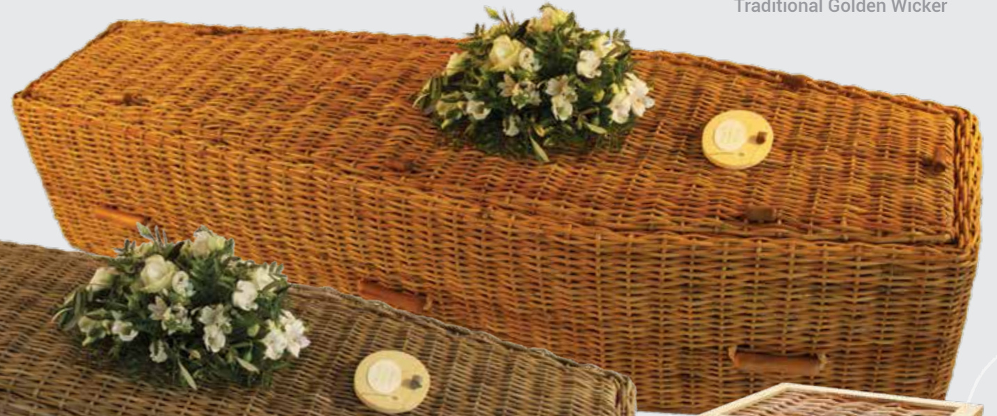
Traditional Golden Wicker

Our 100% biodegradable traditional shaped coffins come in a choice of styles: Golden Wicker and Grey Wicker. The wicker is carefully woven onto a strong wooden Albasia frame and finished with bespoke wooden handles and hand carved wooden peg screws. Each coffin comes with an unbleached calico lining and a choice of personalised nameplate and footplate - which can be engraved.