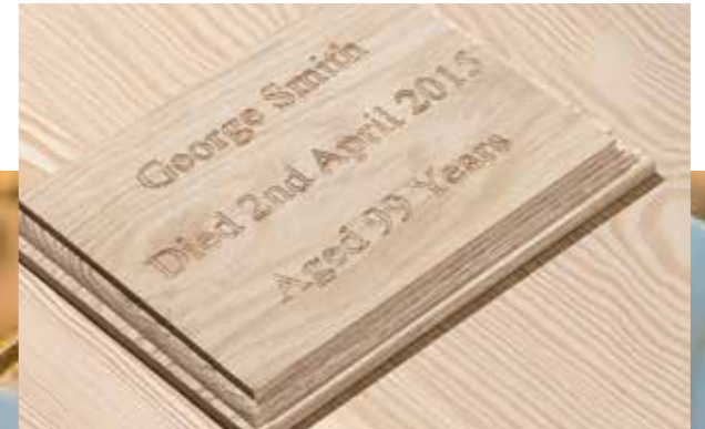
Engraved wood mount available on all wooden coffins