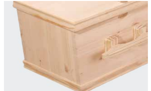
Crafted butt joint ends