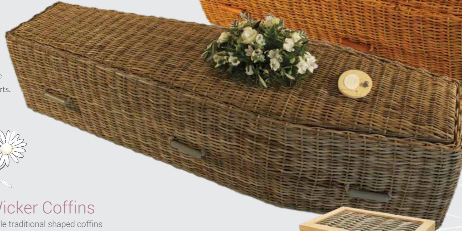
Traditional Grey Wicker