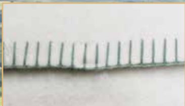
Sage stitch (optional)