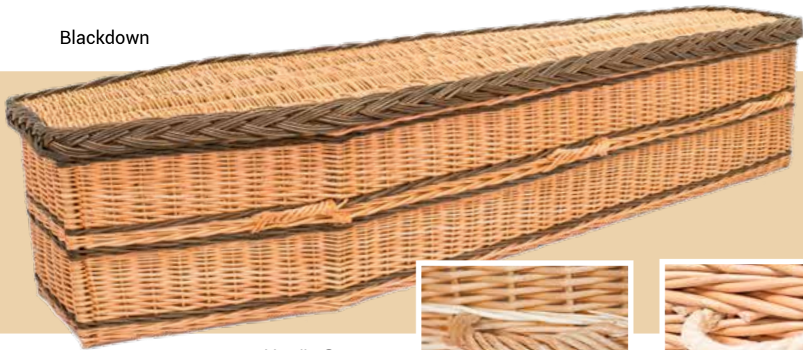
Handle Options -