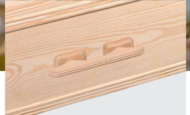
Matching bespoke pine handles