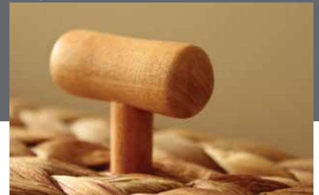
Hand carved wooden screw pegs