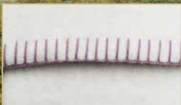
Heather stitch (optional)